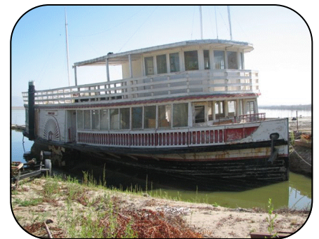
Lake Elsinore Princess