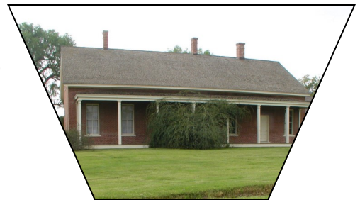
Jensen-Alvarado Historic Ranch and Museum