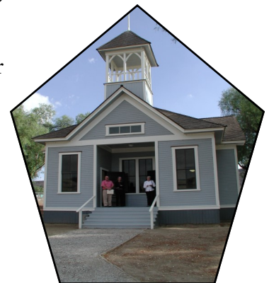
San Timoteo Schoolhouse Restoration project