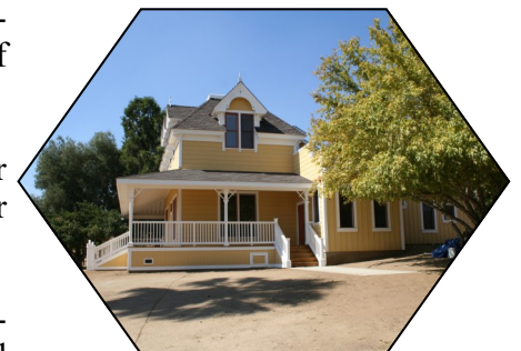
Gilman House Restoration project