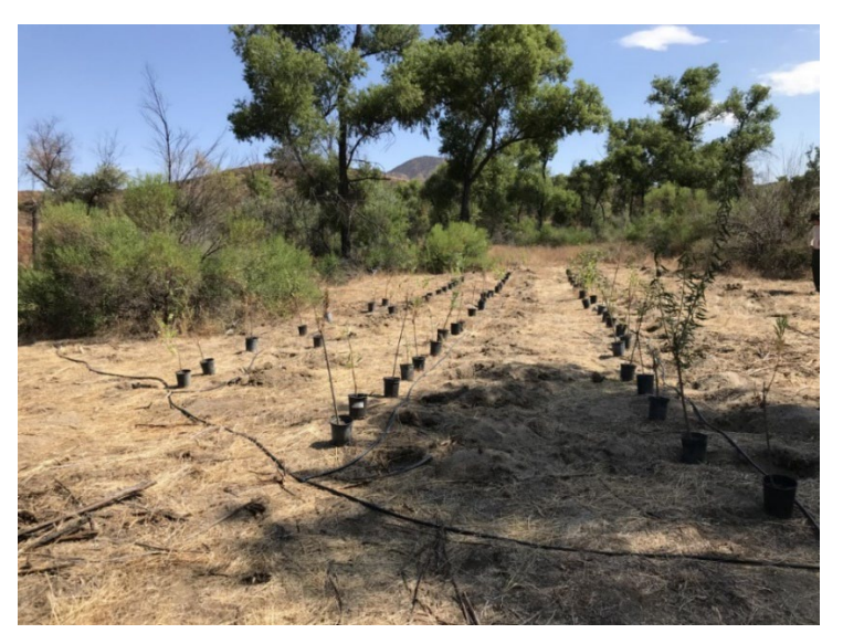
Tucalota creek restoration area

Reserve staff followed up on the previous year's removal of tamarisk by Cal-Fire crews in Tucalota Creek by installing native riparian species and a drip line irrigation system. Reserve staff propagated approximately 100 native plants this year, which included various riparian species. These plants were installed in the creek and placed on drip irrigation as part of the active restoration component of the project.