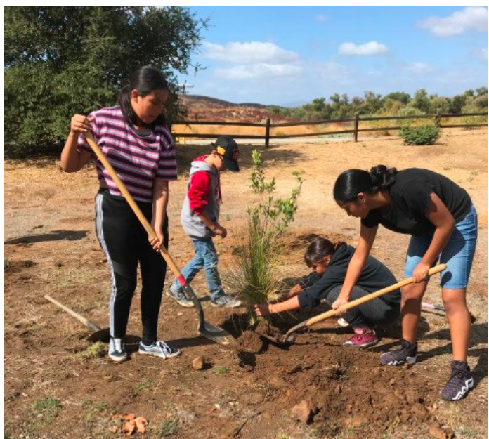
Girl Scout troop installing native plants at Alamos Schoolhouse

A Girl Scout Troop has installed 18 native plants in front of the Alamos Schoolhouse. And installed interpretive signage for the project.