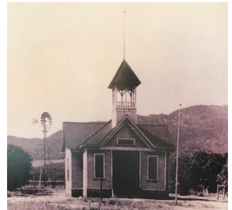
Photo caption for #1 and #2: Children dance the May pole at the 2019 Fall Fest at San Timoteo Canyon Schoolhouse just as youngsters did more than 100 years ago on the same school grounds. Photo caption for #3: Built in 1883, the San Timoteo Canyon Schoolhouse still stands just west of Beaumont, CA.